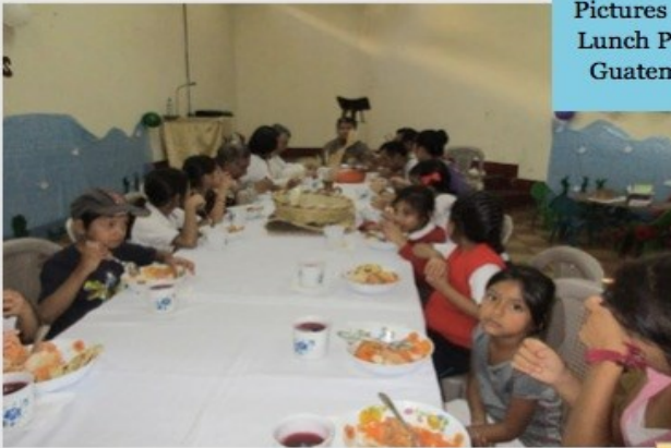
Pictures of the Hot Lunch Program in Guatemala City.